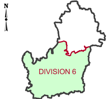
DIVISION 6 Location Map