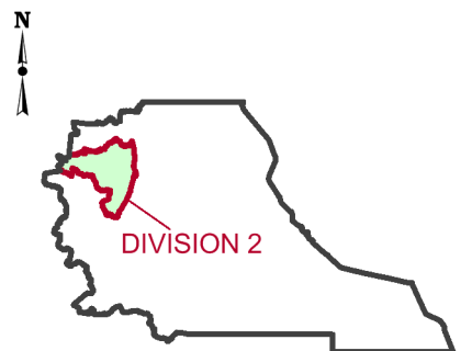
DIVISION 2 Location Map

DISCLAIMER While every care has been taken to ensure the accuracy of this product, the Electoral Commission Queensland (ECQ) makes no representations or warranties about its accuracy, reliability, completeness or suitability for any particular purpose and disclaims all responsibility and all liability (including, without limitation, liability in negligence) for all expenses, losses, damages (including indirect and consequential damage) and cost which might be incurred as a result of the data being inaccurate or incomplete in any way and for any reason.