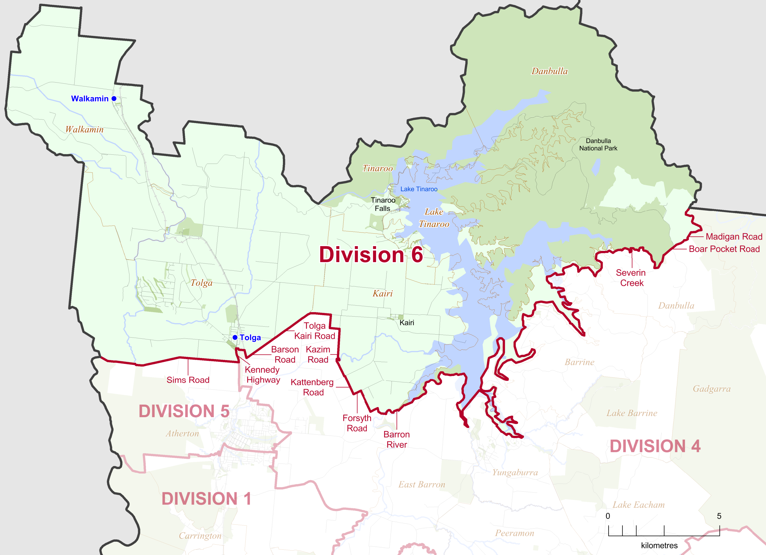
DIVISION 6 Location Map